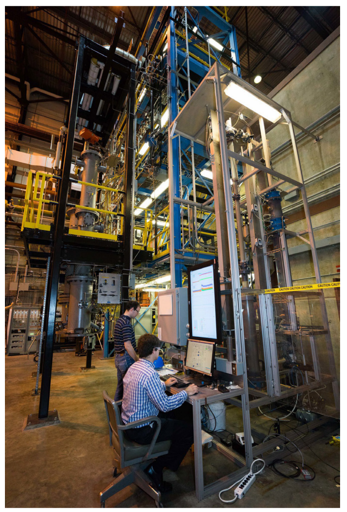
Researchers at work in the chemical looping reactor at the NETL site in Morgantown, W.Va.

https://netl.doe./gov/business/partnerships