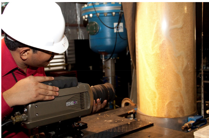
Figure 3. Researcher collecting high-speed video for particle tracking.