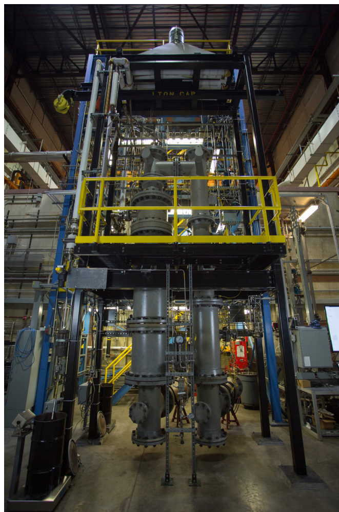
Figure 4. 50-kWth chemical looping reactor.