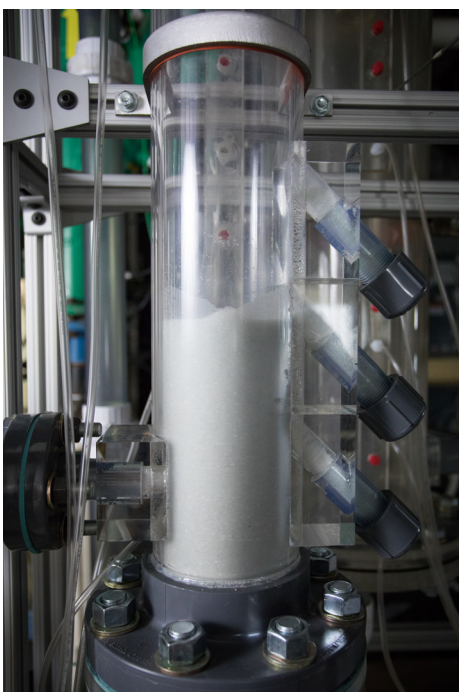
Figure 5. 4-inch diameter cold-flow bubbling fluidized bed.

The solid fuel fluidized bed reactor (under construction, to be ready in May 2018) is a 4-inch fluidized bed reactor with the ability to test larger quantities of solids mixed with pulverized solid fuel. The unit has the capability to react solids continuously at a maximum feed rate of 1 cubic foot per hour at 1,000 °C and 5 psig, instead of in batch mode as in the single fluid bed reactor. The bed is fluidized with nitrogen, while methane, carbon dioxide, steam, or air can be added to the fluidizing gas. The gas analysis capabilities are equivalent to that of the single fluidized bed reactor.