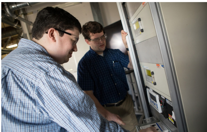
Figure 2. Researchers inspecting instrumentation measuring the outlet gas composition of the single fluid bed reactor.

The chemical looping reactor facility is a 50-kWth natural gas-fed prototype unit for studying the performance of CLC materials. It is one of only a few circulating chemical looping test units in the U.S. The unit is carbon-steel refractory lined, and heat is added indirectly, separate from the solids path. The reactor system consists of an 8-inch bubbling fluidized bed fuel reactor and a 6-inch turbulent bed air reactor. The chemical looping reactor facility can operate up to 1,000 °C, with a global operating pressure between 8 and 20 pounds per square inch gauge (psig). The unit is also able to capture most of the fine materials, allowing for observation of the properties of the material over time and estimation of the rate of solids breakdown to assess the material lifetime.