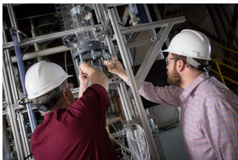
Figure 7. Researchers assembling the cold-flow carbon stripper.

The carbon stripper is a 4-inch diameter cold-flow spouted bed combined with a riser. This system is specifically designed to separate two solids based on particle density and/or particle diameter differences, such as separating coal ash from an oxygen carrier in a solid-fuel chemical looping process. A mixture of material can be continuously fed into the unit, with the two outlet streams continuously being measured with scales.