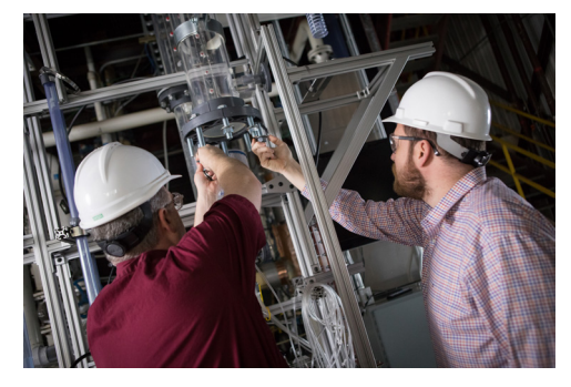
Figure 7. Researchers assembling the cold-flow carbon stripper.

The carbon stripper is a 4-inch diameter cold-flow spouted bed combined with a riser. This system is specifically designed to separate two solids based on particle density and/or particle diameter differences, such as separating coal ash from an oxygen carrier in a solid-fuel chemical looping process. A mixture of material can be continuously fed into the unit, with the two outlet streams continuously being measured with scales.