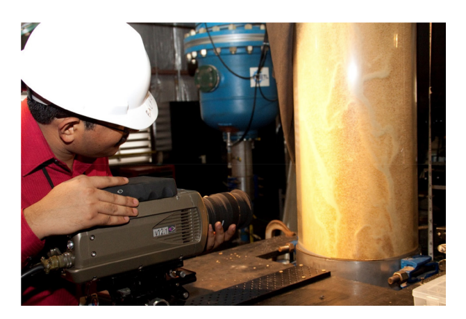
Figure 3. Researcher collecting high-speed video for particle tracking.