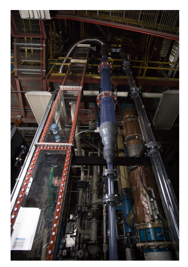
Figure 6. Cold flow 3-inch by 12-inch rectangular riser (left), 4-inch diameter riser (right), and 12-inch diameter riser (background).

NETL has three cold-flow circulating fluidized beds with different riser cross-sectional areas: a 12-inch diameter. 4-inch diameter and a 3-inch by 12-inch rectangular riser. All three units are constructed out of steel and acrylic and operate at room temperature. The 12-inch diameter circulating fluidized bed consists of a 12-inch diameter, 50-foot-tall riser and a 10-inch diameter stand pipe. The 4-inch diameter circulating fluid bed has been designed to be a one-third scale of the 12-inch diameter circulating fluid bed, allowing for scaling studies. The 3-inch by 12-inch rectangular circulating fluid bed has been designed specifically to allow high-speed imaging of the riser flow so that particle tracking techniques can be used to measure particle velocities and flow patterns. Solids can also be feed into the riser at various locations, allowing for jet penetration studies.