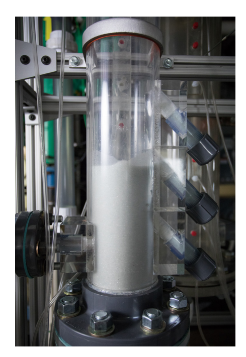
Figure 5. 4-inch diameter cold-flow bubbling fluidized bed.

The solid fuel fluidized bed reactor (under construction, to be ready in May 2018) is a 4-inch fluidized bed reactor with the ability to test larger quantities of solids mixed with pulverized solid fuel. The unit has the capability to react solids continuously at a maximum feed rate of 1 cubic foot per hour at 1,000 °C and 5 psig, instead of in batch mode as in the single fluid bed reactor. The bed is fluidized with nitrogen, while methane, carbon dioxide, steam, or air can be added to the fluidizing gas. The gas analysis capabilities are equivalent to that of the single fluidized bed reactor.