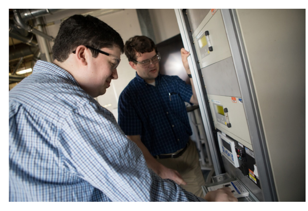
Figure 2. Researchers inspecting instrumentation measuring the outlet gas composition of the single fluid bed reactor.