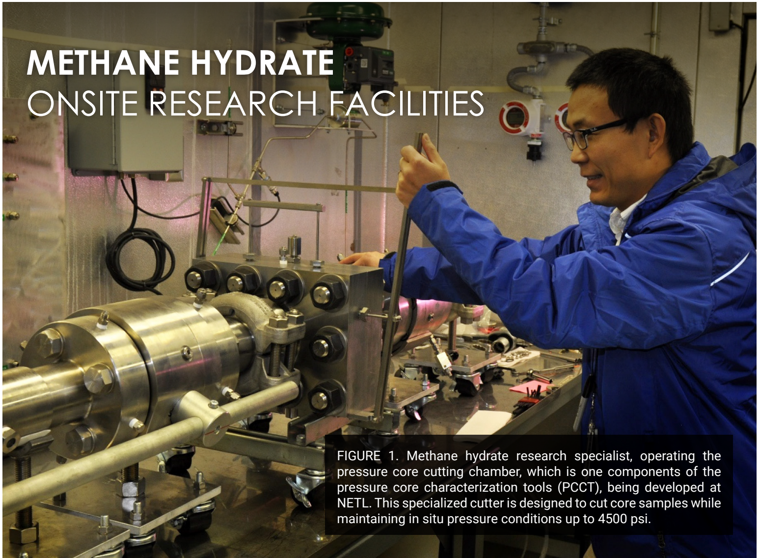
FIGURE 1. Methane hydrate research specialist, operating the pressure core cutting chamber, which is one component of the pressure core characterization tools (PCCT), being developed at NETL. This specialized cutter is designed to cut core samples while maintaining in situ pressure conditions up to 4500 psi.