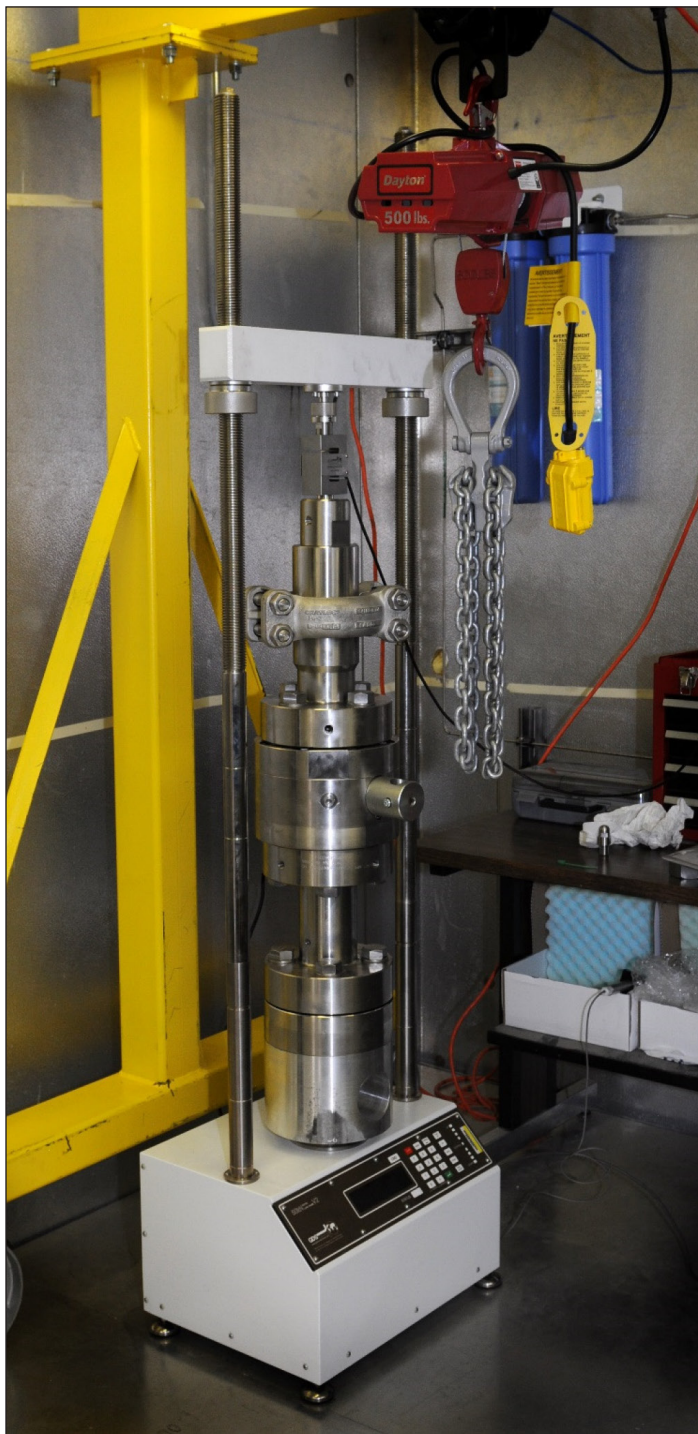
FIGURE 2. The effective stress chamber (ESC), pictured above, is a critical component of the pressure core characterization tools (PCCT). This chamber is used to measure acoustic, mechanical, and hydraulic properties of pressure core specimens while maintaining in situ pressure and temperature conditions.

manufactured is a transport chamber, designed to preserve specimens at in situ conditions for transport to other methane hydrate research laboratories.