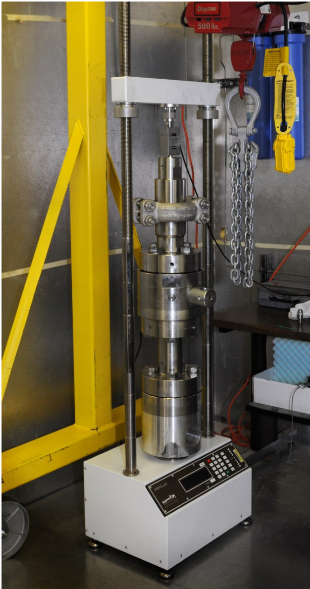
Figure 2. The effective stress chamber (ESC), pictured above, is a critical component of the pressure core characterization tools (PCCT). This chamber is used to measure acoustic, mechanical, and hydraulic properties of pressure core specimens while maintaining in situ pressure and temperature conditions.

samples. Most components of the PCCT have been completed. The last component being manufactured is a transport chamber, designed to preserve specimens at in situ conditions for transport to other methane hydrate research laboratories.