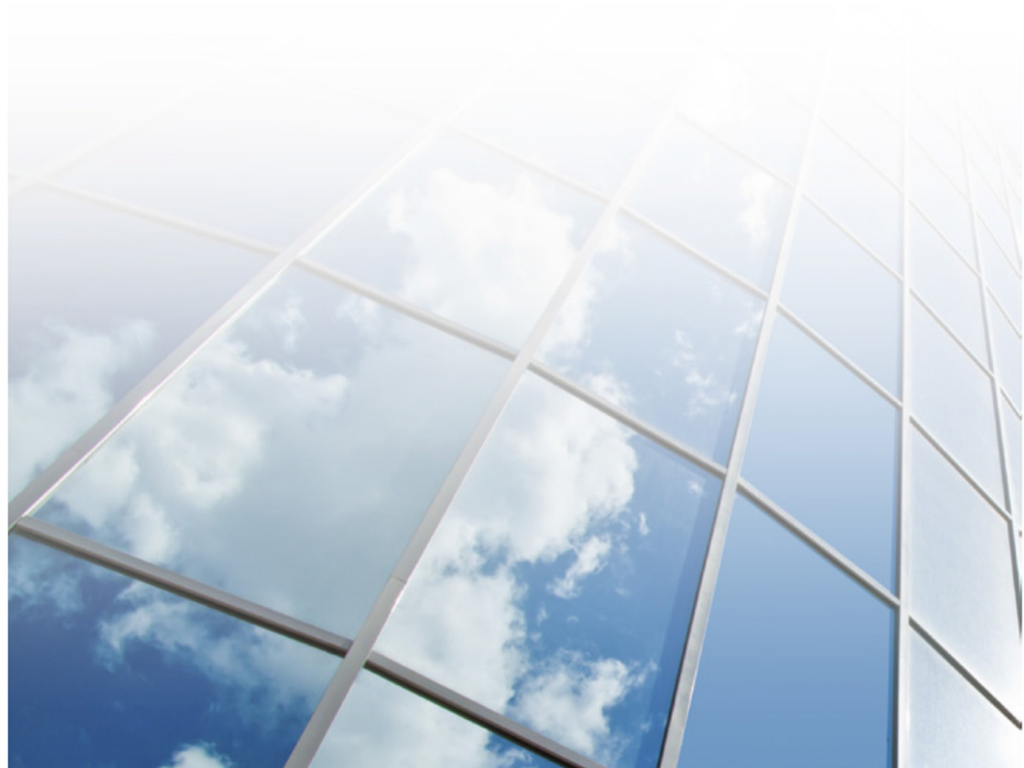
Figure 2. NETL has licensed one of its patented CO 2 -removal sorbents to small business enVerid Systems. enVerid has adopted the sorbent for use their retrofit air-recirculation system, designed to increase the energy efficiency of commercial HVAC systems.