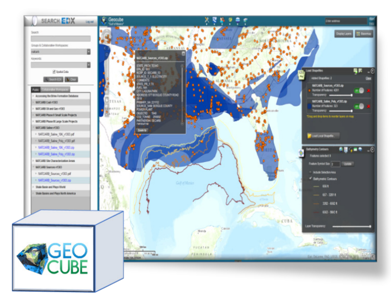
Screen shot of Geocube tool. Geocube allows users to map spatial data hosted within EDX and from external sources as well.