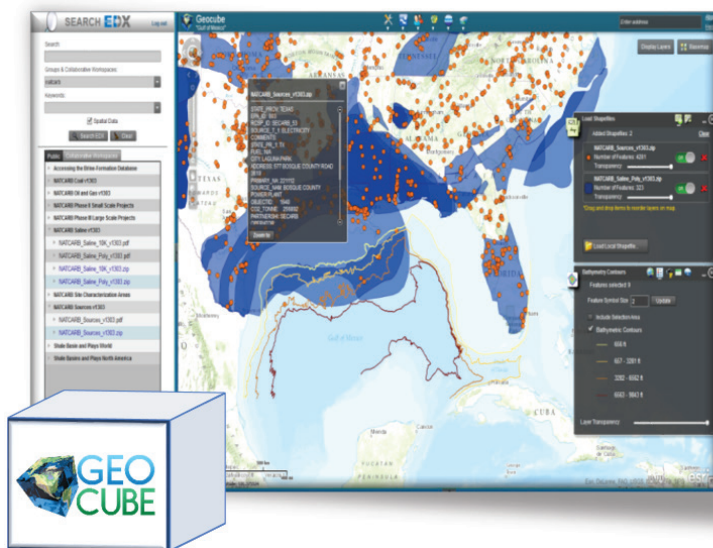
Screen shot of Geocube tool. Geocube allows users to map spatial data hosted within EDX and from external sources as well.