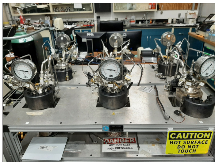
FIGURE 2. Flow-through unit for studying CO 2 -enhanced oil recovery.

Research aimed at monitoring the long-term storage stability and integrity of CO 2 sequestered in geologic formations is one of the most pressing areas that needs to be understood if geologic sequestration is to become a significant factor in reducing greenhouse gas emissions. The most promising geologic formations under consideration for CO 2 sequestration are active and depleted oil and gas formations, brine formations, and deep, unmineable coal seams. Unfortunately, the long-term CO 2 storage capabilities of these formations are not well understood.