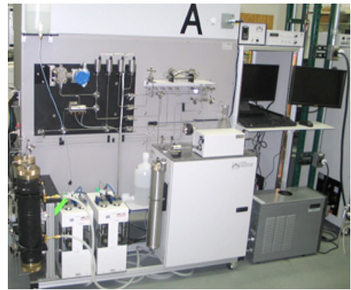
Figure 3. CFS-839Z water-rock flow-through system.