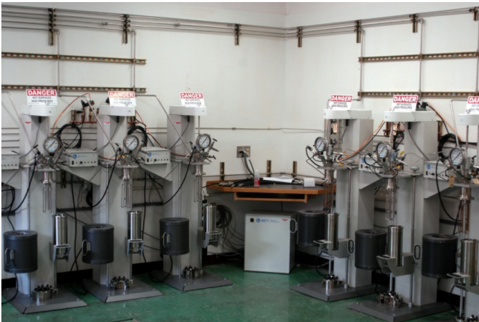
Figure 1. Six fixed-head autoclave system with PC interface.