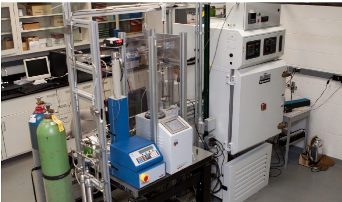
NETL Phase and Composition Analysis Laboratory, Pittsburgh, PA.

The U.S. Department of Energy (DOE) National Energy Technology Laboratory (NETL) is combining pressure-volume-temperature (PVT) data and viscosity data from a comprehensive literature survey with PVT data and viscosity data from a focused experimental program to create a comprehensive database needed to develop new EoS and viscosity correlations. The new EoS correlations will be used to determine the number of phases, composition of phases, phase densities, and phase boundaries (e.g., vapor pressure and dew points of pure components or mixtures) at extreme pressure and temperature conditions. NETL will also evaluate viscosity correlations for pure components and mixtures at the same conditions applicable to the vapor, liquid, or supercritical fluid phase. These correlations are designed to be accurate for the conditions associated with emerging technologies for deep aquifer sequestration and ultra-deep petroleum production.