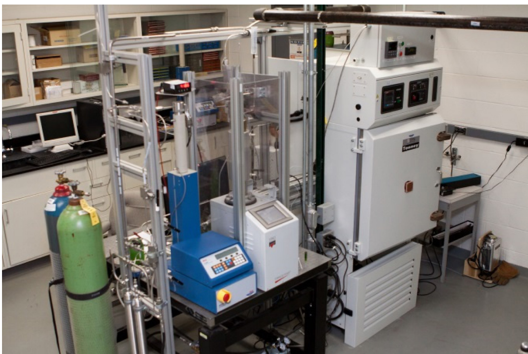
NETL Phase and Composition Analysis Laboratory, Pittsburgh, PA.

The U.S. Department of Energy (DOE) National Energy Technology Laboratory (NETL) is combining pressure-volume-temperature (PVT) data and viscosity data from a comprehensive literature survey with PVT data and viscosity data from a focused experimental program to create a comprehensive database needed to develop new EoS and viscosity correlations. The new EoS correlations will be used to determine the number of phases, composition of phases, phase densities, and phase boundaries (e.g., vapor pressure and dew points of pure components or mixtures) at extreme pressure and temperature conditions. NETL will also evaluate viscosity correlations for pure components and mixtures at the same conditions applicable to the vapor, liquid, or supercritical fluid phase. These correlations are designed to be accurate for the conditions associated with emerging technologies for deep aquifer sequestration and ultra-deep petroleum production.