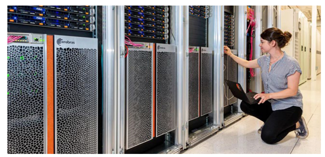
NETL and Cerebras have signed an agreement in which NETL is developing the WFA and Cerebras is running tests on their hardware cluster pictured here.

This paradigm shift in computing enabled by NETL's WFA has the potential to revolutionize much of the lab's critical decarbonization research. Currently, the research team is working to use the WFA to develop a finite volume computational fluid dynamics solver, which will help design future energy systems in far less time and at reduced monetary and energy costs. In the future, the WFA could branch out into areas such as geodynamics, geomechanics, molecular dynamics and structural dynamics.