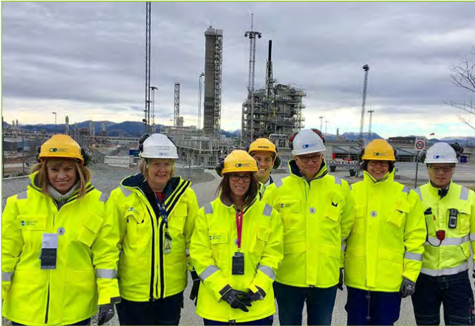
NETL employees with hosts at Technology Centre Mongstad (February 2017).

An NETL-supported project successfully concluded a six-month testing campaign at the Technology Centre Mongstad (TCM) in western Norway, a facility for testing and improving CO 2 capture. Approximately 14,000 metric tons of CO 2 were captured during testing. DOE and the Royal Norwegian Ministry of Petroleum and Energy have a bilateral Memorandum of Understanding (MOU) covering fossil energy-related research to leverage each country's investments in carbon capture, utilization, and storage (CCUS).