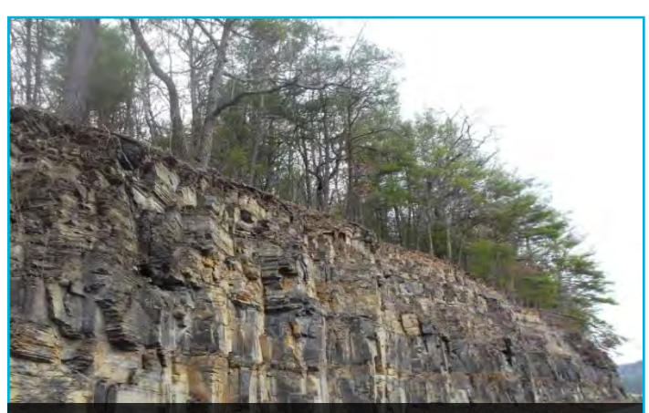
Parallel, vertical, orthogonal natural fracture faces (joint sets) in an outcrop of organic-rich Millboro Shale (Marcellus equivalent), Clover Creek, VA.

Newsletters, program fact sheets, best practices manuals, roadmaps, educational resources, presentations, and more information related to the Carbon Storage Program is available on DOE's Energy Data eXchange (EDX) website .