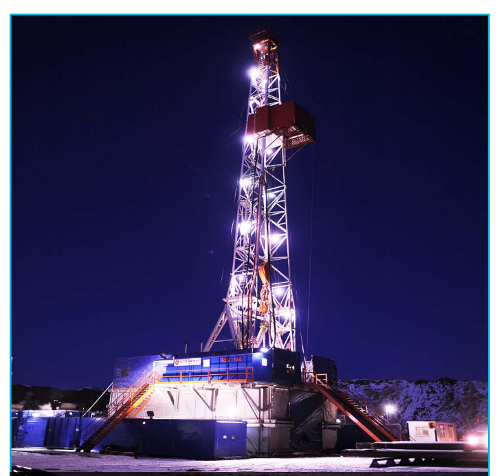
Rig drilling a site characterization well at the Craig Power Station in Colorado, USA.

Newsletters, program fact sheets, best practices manuals, roadmaps, educational resources, presentations, and more information related to the Carbon Storage Program is available on DOE's Energy Data eXchange (EDX) website .