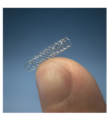
Platinum chromium coronary stent.