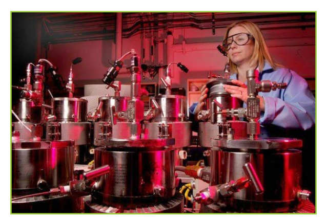
Innovative Technology Experiences for Students and Teachers (ITEST)

National Science Foundation, Deadline, August 8, 2018