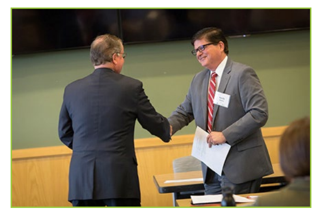
NETL Co-hosts with Carnegie Mellon on Subsurface Workshop

NETL co-hosted, with Carnegie Mellon University's Wilton E. Scott Institute for Energy Innovation, a collaborative workshop, "Real-Time Decision-Making for the Subsurface," that brought national laboratories, academic institutions, and industry stakeholders together July 17-18 in Pittsburgh. The workshop focused on recent advancements and continued challenges associated with the subsurface. Plenary sessions and interactive breakout groups tackled a variety of timely topics, such as improving resource recovery, developing autonomous monitoring systems, and managing induced seismicity. Participants considered advancements in high-performance computing, predictive modeling, and sensing technologies to develop recommendations for achieving real-time analysis of subsurface data for fossil energy needs. A report will be published later this year.