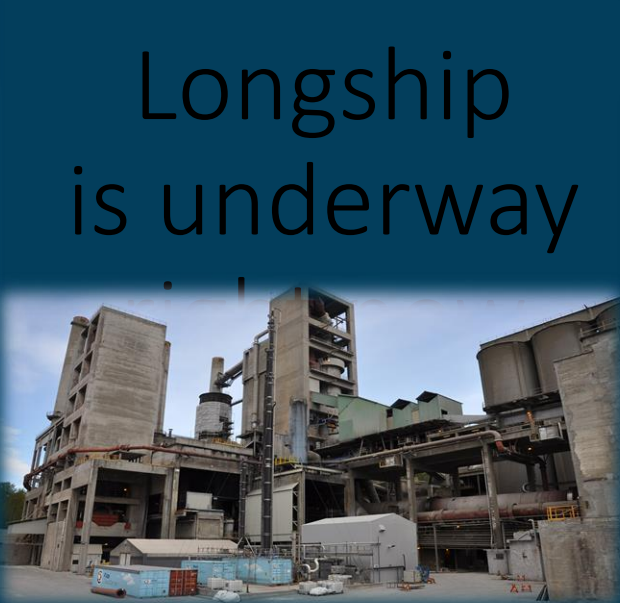
Longship is underway