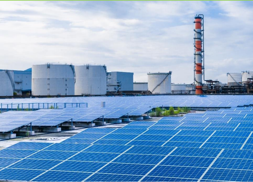
Investing in Domestic Clean Energy Manufacturing