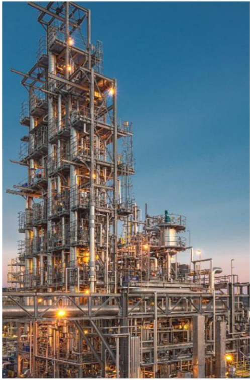
National Carbon Capture Center