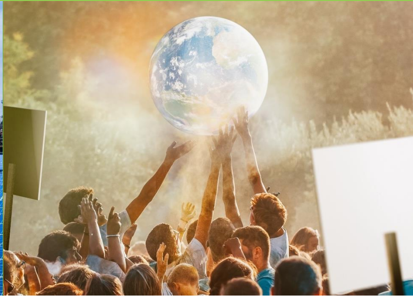
Advancing Environmental Justice