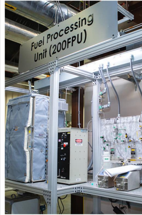
NETL's ReACT Facility