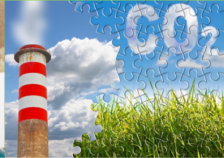
Tackling the Climate Crisis