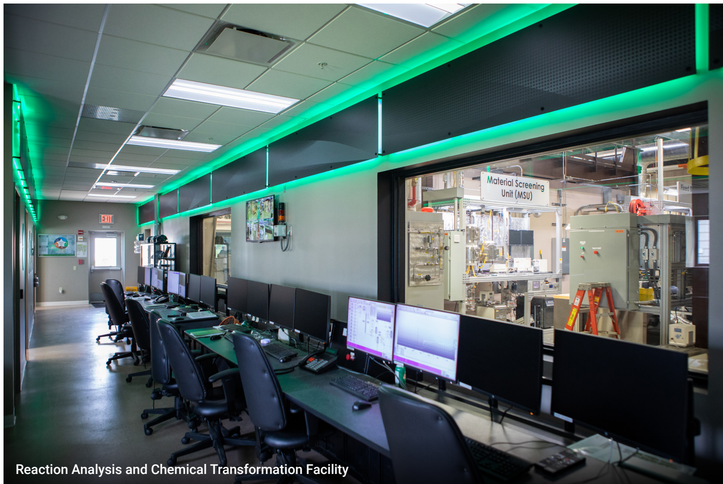
Reaction Analysis and Chemical Transformation Facility

By 1954, the Morgantown laboratory became the Appalachian Experiment Station for on-site coal research with a staff of 109 employees. Construction of the Appalachian Experiment Station, which comprised an administrative building and laboratories for the study of petroleum production and coal gasification, began on Collins Ferry Road in June 1952. The new Appalachian Experiment Station represented an important step toward consolidating ongoing investigations of petroleum, coal and synthetic fuels into an overarching program of fossil-energy research that could help guide federal energy policy.