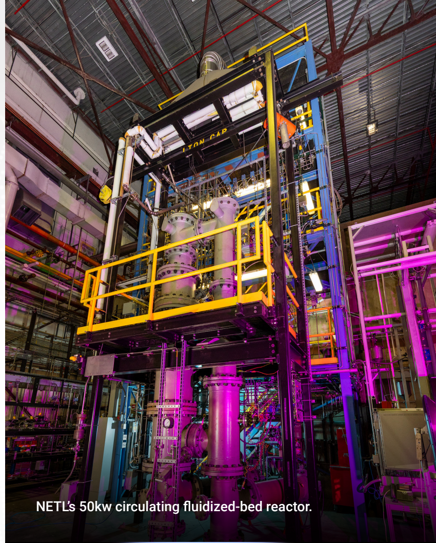
NETL's 50kw circulating fluidized-bed reactor.

NETL invented and patented a nickel-based superalloy (U.S. Patent No. 11,827,955B2) with more than 200% improved creep resistance over commercial alloys. This breakthrough enhances the durability of turbine components, enabling higher-temperature operation, lower maintenance and extended power plant life for coal-fired systems.