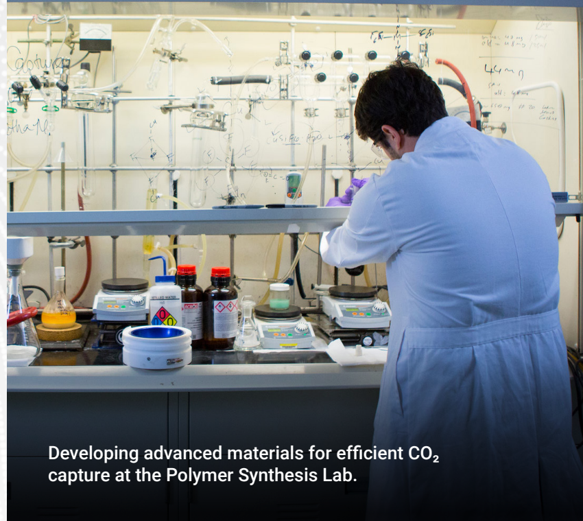
Developing advanced materials for efficient CO 2 capture at the Polymer Synthesis Lab.