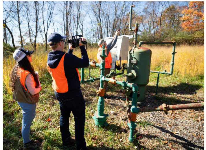
NETL researchers in the field evaluating emissions at a well site.