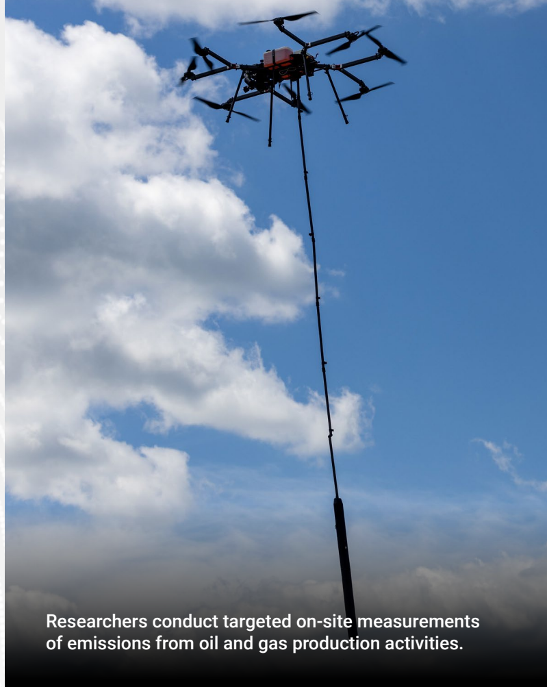
Researchers conduct targeted on-site measurements of emissions from oil and gas production activities.

In advancing pipeline materials, NETL developed an innovative zinc-rich material that can be applied as a coating through a cold-spray process to protect pipelines from the effects of corrosion. This coating was tested at a NW Natural Gas Company site. By developing material and sensor technologies, NETL enhances pipeline durability, public safety and operational efficiency. Further, sensor technology research helps the U.S. move toward more intelligent pipeline systems that can continuously monitor the infrastructure for vulnerabilities or faults.