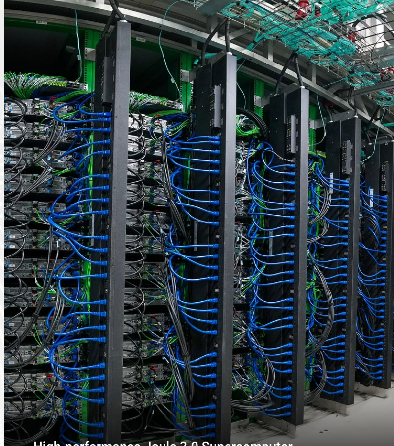
High-performance Joule 3.0 Supercomputer accelerates energy technology development.

NETL's ongoing collaboration with Cerebras Systems is transforming scientific computing. Advanced processor architectures can run complex energy simulations up to 470 times faster than traditional supercomputers. This capability significantly shortens R&D timelines, reduces costs and accelerates the delivery of next-generation energy technologies.