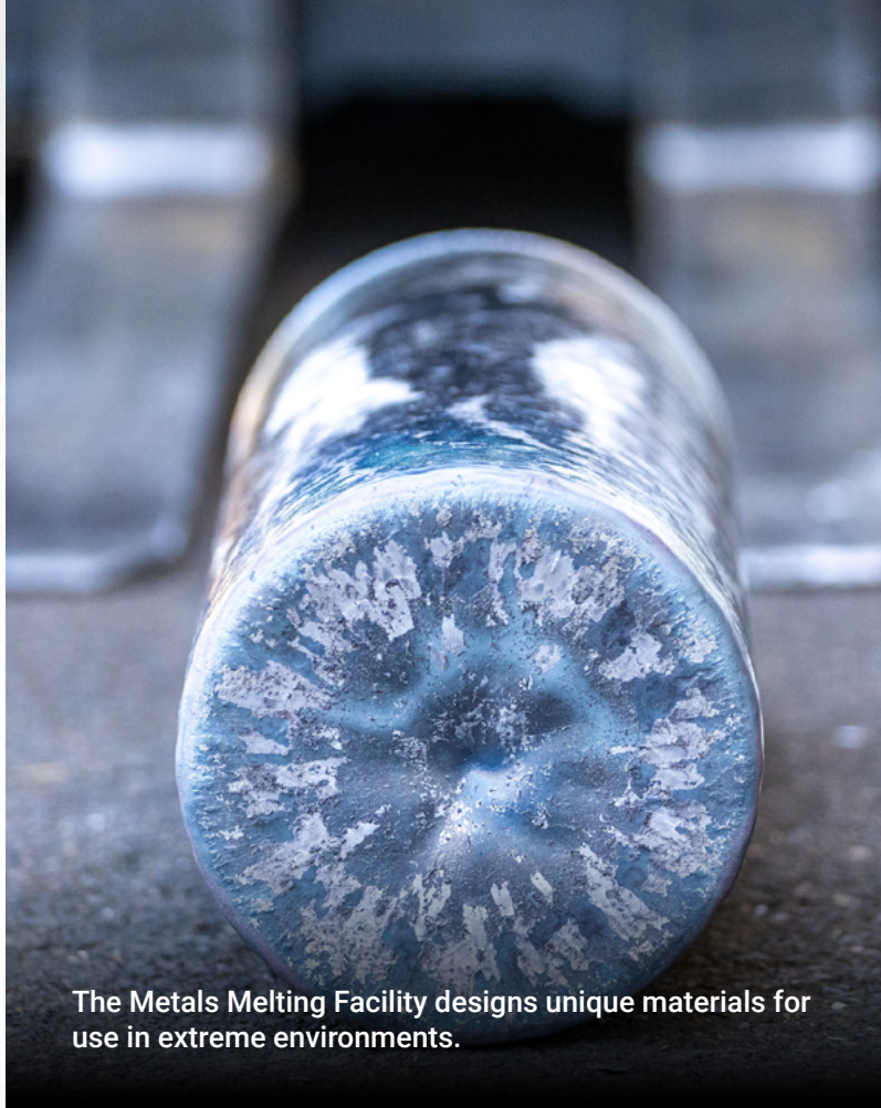
The Metals Melting Facility designs unique materials for use in extreme environments.

Structural materials researchers at NETL have produced a stronger pipeline by using the rare earth element cerium to create a tougher steel alloy. The cerium eliminates the negative impacts of sulfur and oxygen impurities during the steel manufacturing process. Testing shows that the new alloy can improve the steel's ability to absorb energy and resist cracking by up to 50%.