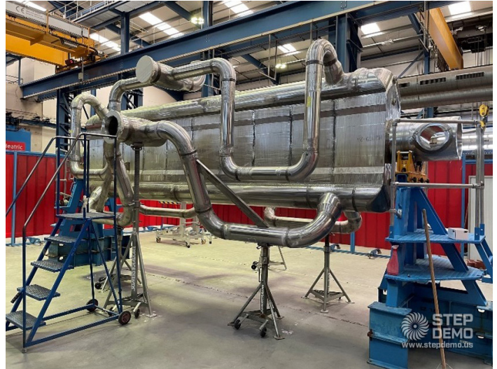
Figure 4. High Temperature Recuperator fabricated by Heatriac for the 10 MWe STEP Pilot Plant Test Facility

The Supercritical Carbon Dioxide Technology Program R&D work described above is closely coordinated with the STEP program. The Office of Fossil Energy and Carbon Management leads the STEP program and is part of a Department of Energy-wide collaboration with the Offices of Nuclear Energy, and Energy Efficiency and Renewable Energy, which leverages the capabilities and interests of these organizations toward the development of supercritical CO 2 power cycles. The mission is to demonstrate a lower cost of electricity with supercritical CO 2 power cycles as applied to nuclear, concentrated solar, and fossil fuel heat sources. To support this mission, the main objective of the STEP program is to build and operate a 10-MWe supercritical CO 2 power cycle test facility for evaluating power cycle and component performance over a range of operating conditions at a relevant scale.