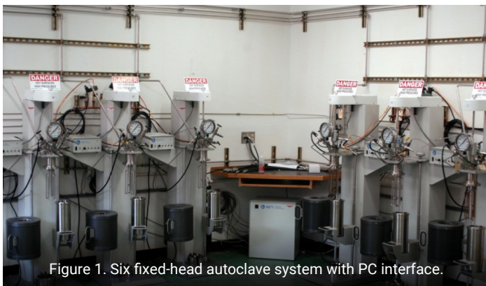
Figure 1. Six fixed-head autoclave system with PC interface.

Research aimed at monitoring the long-term storage stability and integrity of CO 2 sequestered in geologic formations is one of the most pressing areas that needs to be understood if geologic sequestration is to become a significant factor in reducing greenhouse gas emissions. The most promising geologic formations under consideration for CO 2 sequestration are active and depleted oil and gas formations, brine formations and deep, unmineable carbon ore seams. Unfortunately, the long-term CO 2 storage capabilities of these formations are not well understood.