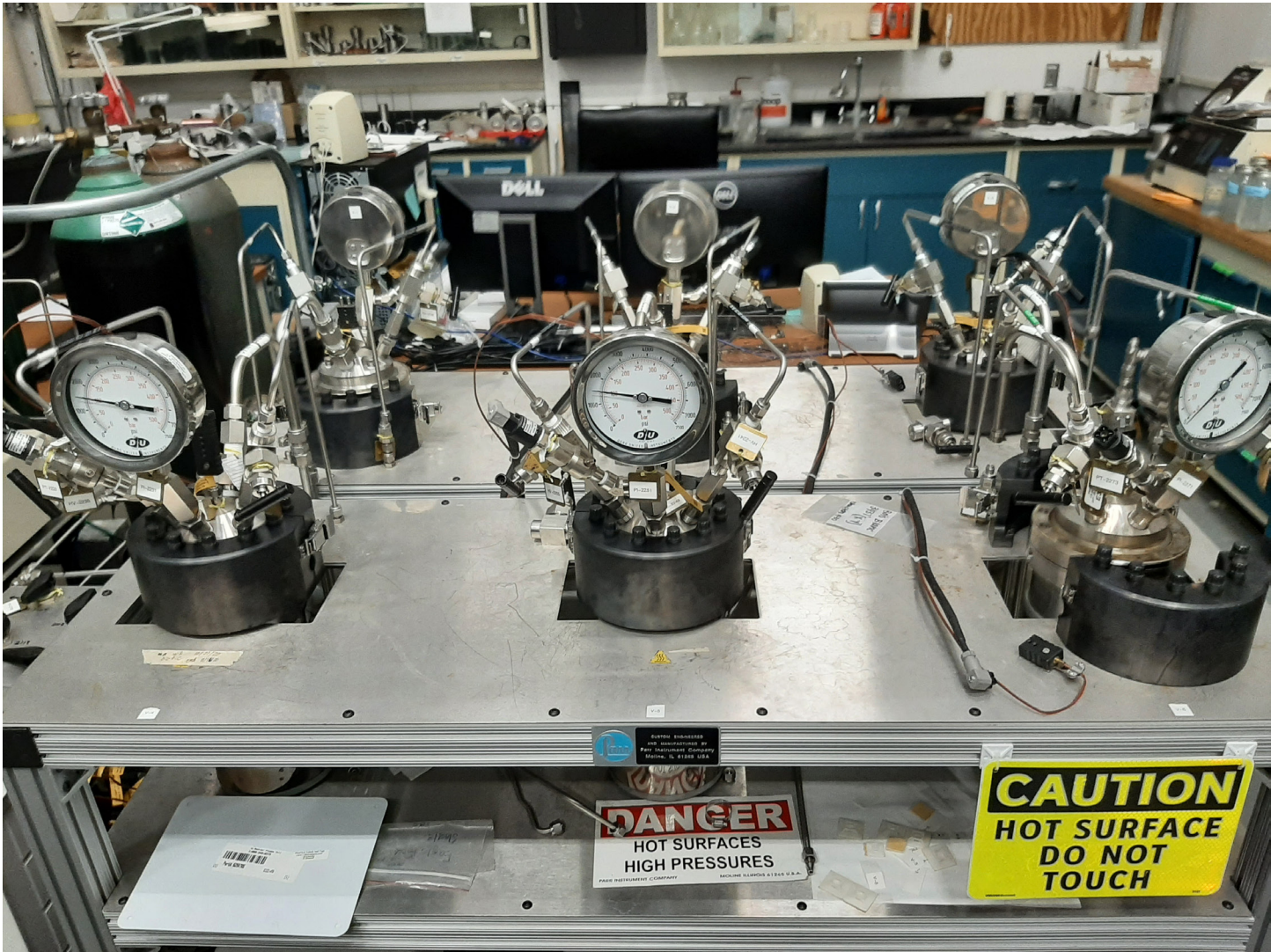
Figure 3. Autoclave array for studying geochemical reactions associated with Carbon Capture and Underground Storage.