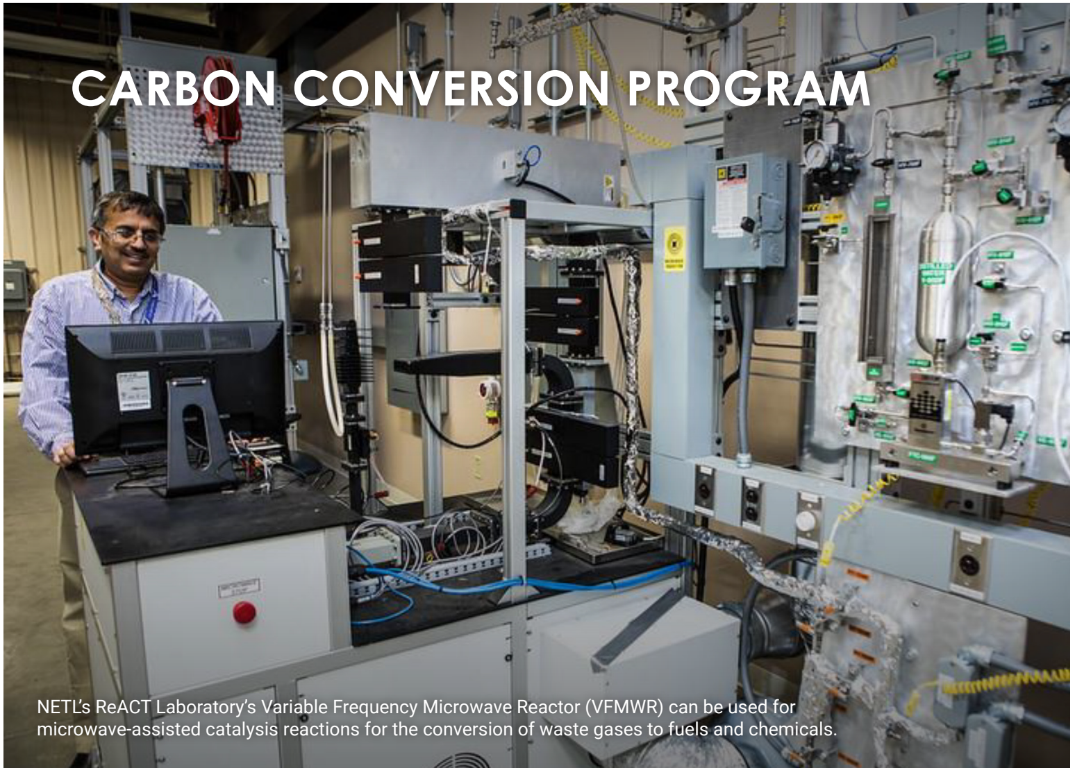
NETL's ReACT Laboratory's Variable Frequency Microwave Reactor (VFMWR) can be used for microwave-assisted catalysis reactions for the conversion of waste gases to fuels and chemicals.