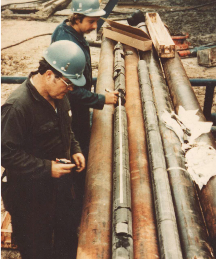
Eastern Gas Shales Coring Operation from the 1980s.

Historically, DOE has employed field laboratories to gather basic data, test new tools and methods and demonstrate emerging technologies under field conditions so that industry will be able to assess their utility and accelerate adoption and deployment. Perhaps the most successful of DOE's field laboratory efforts were the tight gas and gas shales research programs of the 1980s and 90s, which played an important role in subsequent development of the nation's enormous unconventional