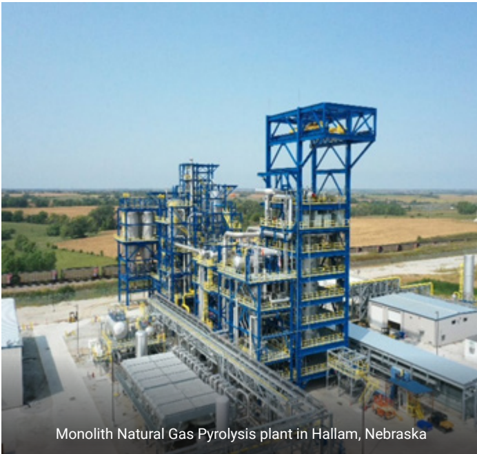
Monolith Natural Gas Pyrolysis plant in Hallam, Nebraska

The U.S. DOE's Energy Earthshots Initiative seeks new breakthrough technologies that will enable more abundant, affordable, and reliable clean energy solutions over the next decade and support the Biden Administration's goal of net-zero carbon emissions by 2050. The NG-DHT Program is focused on technologies related to hydrogen, a clean energy carrier that can be used in a fuel cell or combusted for heat or electricity without releasing carbon emissions. Technology development and maturation under the NG-DHT Program will focus on developing advanced analytical tools and validating new technologies related to the production of hydrogen from fossil fuels as well as safe and reliable nationwide hydrogen transport and storage, all in a manner that leverages existing natural gas resources and infrastructure at a mitigated carbon intensity. The NG-DHT Program is advancing along several parallel paths across hydrogen production, transport, and storage: