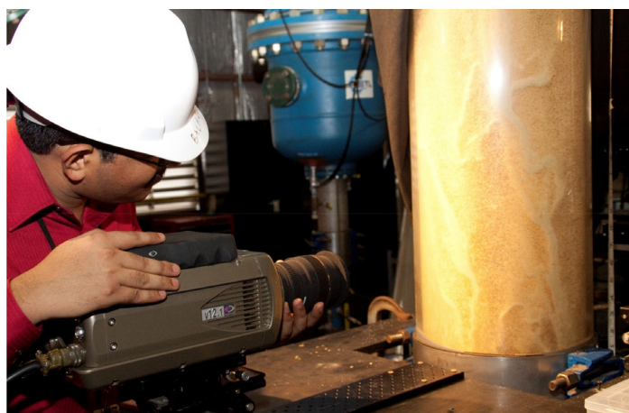
Figure 3. Researcher collecting high-speed video for particle tracking.