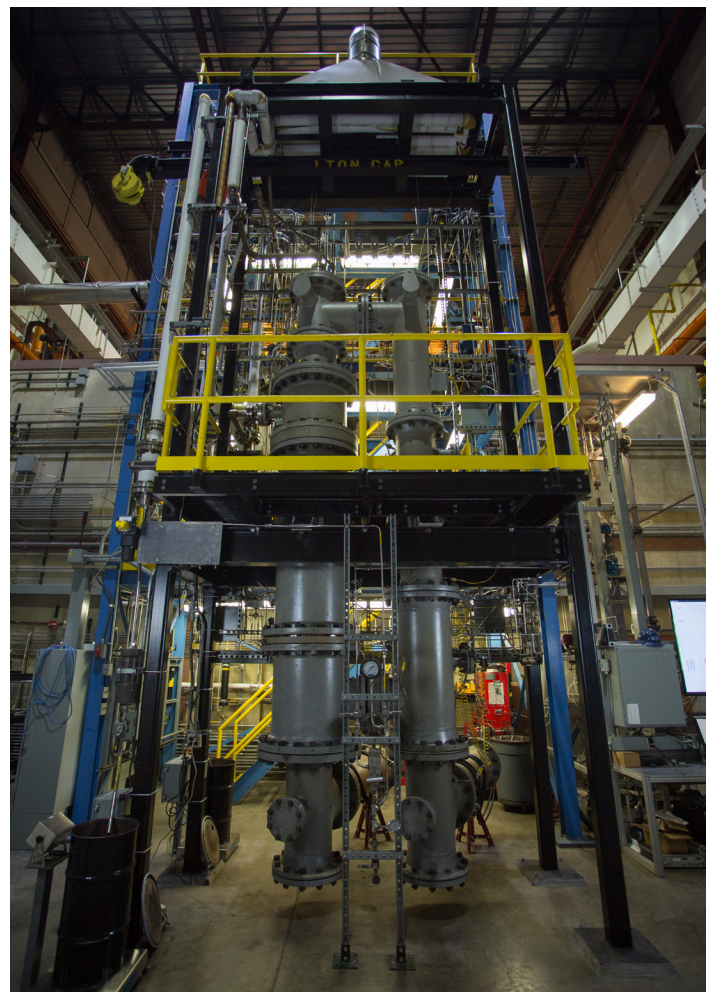
Figure 4. 50-kWth chemical looping reactor.

The chemical looping reactor facility is a 50-kWth natural gas-fed prototype unit for studying the performance of CLC materials. It is one of only a few circulating chemical looping test units in the U.S. The unit is carbon-steel refractory lined, and heat is added indirectly, separate from the solids path. The reactor system consists of an 8-inch bubbling fluidized bed fuel reactor and a 6-inch turbulent bed air reactor. The chemical looping reactor facility can operate up to 1,000 °C, with a global operating pressure between 8 and 20 pounds per square inch gauge (psig). The unit is also able to capture most of the fine materials, allowing for observation of the properties of the material over time and estimation of the rate of solids breakdown to assess the material lifetime.