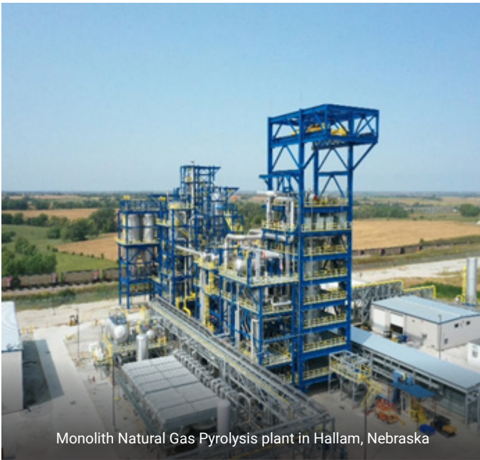
Monolith Natural Gas Pyrolysis plant in Hallam, Nebraska

The U.S. DOE's Energy Earthshots Initiative seeks new breakthrough technologies that will enable more abundant, affordable, and reliable clean energy solutions over the next decade and support the Biden Administration's goal of net-zero carbon emissions by 2050. The NG-DHT Program is focused on technologies related to hydrogen, a clean energy carrier that can be used in a fuel cell or combusted for heat or electricity without releasing carbon emissions. Technology development and maturation under the NG-DHT Program will focus on developing advanced analytical tools and validating new technologies related to the production of hydrogen from fossil fuels as well as safe and reliable nationwide hydrogen transport and storage, all in a manner that leverages existing natural gas resources and infrastructure at a mitigated carbon intensity. The NG-DHT Program is advancing along several parallel paths across hydrogen production, transport, and storage: