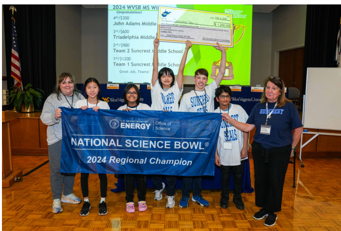
2024 West Virginia Regional Science Bowl champions Suncrest Middle School, Team 1

In addition to the enthusiastic gratitude of WVSB participants and organizers, the WVSB offers volunteers an opportunity to network with area STEM professionals and, at the same time, demonstrate leadership as a professional role model. WVSB volunteers are an integral part of a nation- and state-wide effort to encourage students to pursue STEM fields so critical to our future workforce. Enhance your resume, serve your community, and develop people skills – all while having fun!