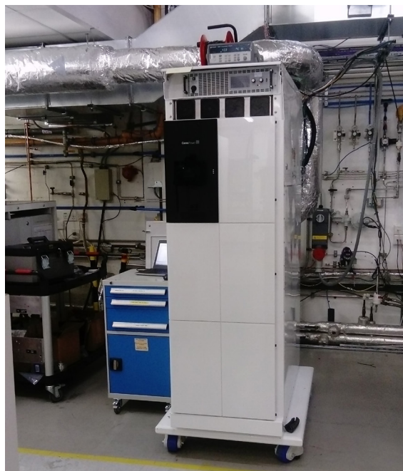
FIGURE 3. Cummins/Ceres Power 10 kWe SOFC System.