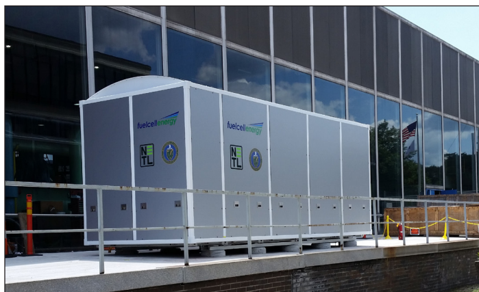
FIGURE 2. FuelCell Energy 200 kWe Prototype System.

Additional information may be found on NETL's Solid Oxide Fuel Cell web page.