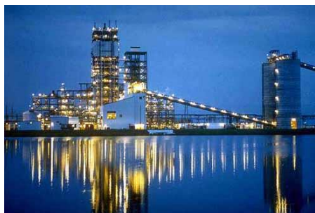
Tampa Electric Integrated Gasification Combined Cycle Plant

With headquarters in downtown Washington, DC and Germantown, Maryland, the Department of Energy's Office of Fossil Energy (FE) maintains a technology development and commercialization capability that includes more than 1,000 scientists, engineers, technicians, and administrative staff. FE relies on the National Energy Technology Laboratory (NETL)—DOE's only national laboratory focused solely on fossil energy research—to complete high-priority technology development initiatives that meet DOE's energy goals. NETL has research and development (R&D) campuses in Morgantown, West Virginia; Pittsburgh, Pennsylvania; and Albany, Oregon; and operations offices in Sugar Land, Texas and Fairbanks, Alaska.