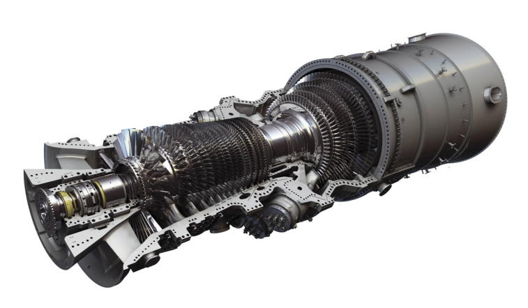
Advanced Combustion Turbine

The Advanced Turbines Program supports three key technologies that will advance clean, low-cost, coal-based power production—and at the same time—take advantage of all fossil fuel opportunities: (1) Advanced Combustion Turbines, (2) Pressure Gain Combustion, and (3) Turbomachinery for Supercritical Carbon Dioxide (SCO<sub>2</sub>) Power Cycles.