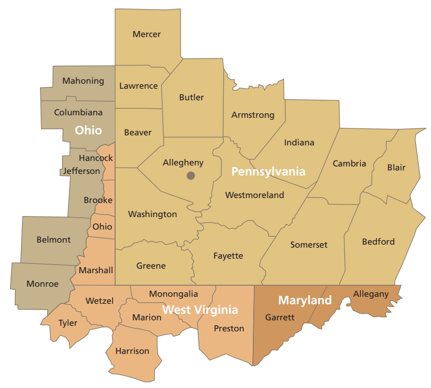
Figure 1.1 The 32 Counties That Make Up the Southwestern Pennsylvania Region