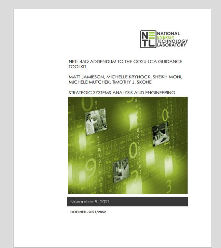
Existing LCA Guidance Documents