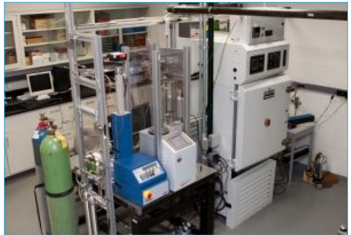
Figure 1: NETL Phase and Composition Analysis Laboratory, Pittsburgh, PA.

NETL researchers have expanded the density and viscosity databases for hydrocarbon compounds to span HPHT conditions. The results have been integrated with existing lower pressure and temperature data, resulting in a comprehensive database. This work is reviewed in the publication, High Temperature, High Pressure Equation of State Density Correlations and Viscosity Correlations , and an interactive database and an associated application to interface with the database. The preliminary databases have been released through NETL's Energy Data Exchange (EDX).