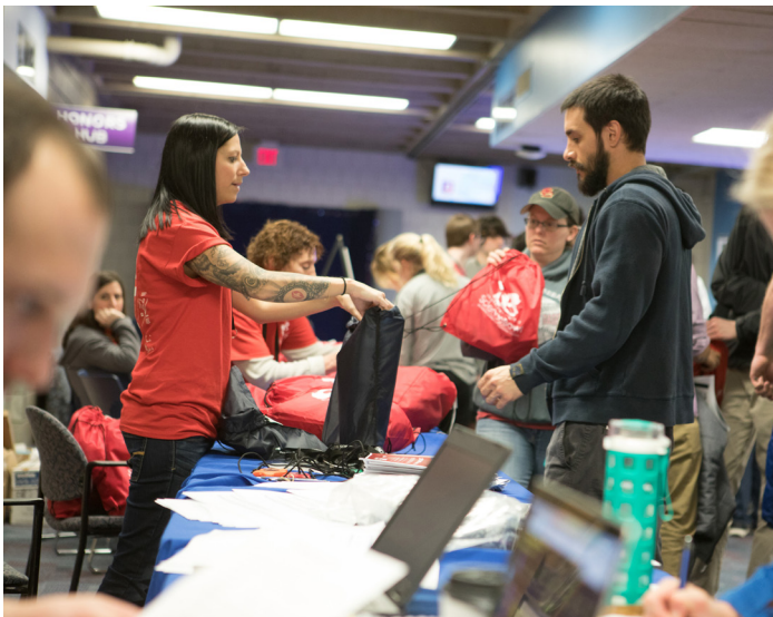
Volunteers distributing prize packages at Command Central at the Community College Allegheny County-South Campus.

In addition to the enthusiastic gratitude of WPASB participants and organizers, the WPASB offers volunteers an opportunity to network with area STEM professionals and, at the same time, demonstrate leadership as a professional role model. WPASB volunteers are an integral part of a nation- and state-wide effort to encourage students to pursue STEM fields so critical to our future workforce. Enhance your resume, serve your community, and develop people skills – all while having fun!