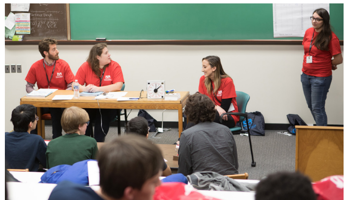
Volunteers enjoy answering practice questions in a competition room before play.

In addition to the enthusiastic gratitude of WPASB participants and organizers, the WPASB offers volunteers an opportunity to network with area STEM professionals and, at the same time, demonstrate leadership as a professional role model. WPASB volunteers are an integral part of a nation- and state-wide effort to encourage students to pursue STEM fields so critical to our future workforce. Enhance your resume, serve your community, and develop people skills – all while having fun!