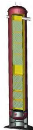
Diagram of Oxygen-Fired Pressurized Fluidized Bed Combustor

The U.S. Department of Energy (DOE) and Canada’s Natural Resources Canada (NR-Can) will open a new facility to test oxy-fired pressurized fluidized bed combustion (oxy-PFBC) to capture carbon dioxide (CO 2 ) emissions from a coal-fired power plant. The 1-megawatt thermal (MWth) facility , located in Canoga Park, California, USA, will test oxy-PFBC as a means to more efficiently and economically capture CO 2 and help advance the commercialization of carbon capture, utilization, and storage (CCUS). The test plant is part of an ongoing collaboration between DOE, NRCAN, and CametEnergy (NRCAN’s research and development [R&D] lab). The National Energy Technology Laboratory (NETL)-managed project, which is being led by the Gas Technologies Institute (GTI), received funding from DOE’s Office of Fossil Energy’s (FE) Advanced Combustion Program . From energy.gov on October 18, 2016.