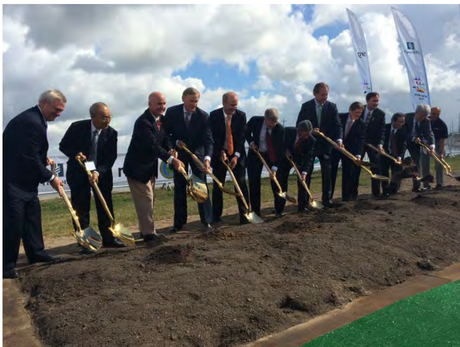
Petra Nova Groundbreaking from September 2014

The post-combustion carbon capture Petra Nova project began commercial operation at the W.A. Parish Plant in Thompsons, Texas, USA, officials announced. The U.S. Department of Energy (DOE) provided funding and the National Energy Technology Laboratory (NETL) provided project management support for the project, which demonstrates how carbon capture technologies can advance the flexibility and sustainability of fossil fuels at a commercial scale. The Petra Nova project has the potential to capture 1.6 million tons of carbon dioxide (CO 2 ) per year from an existing coal-fired power plant. From energy.gov on January 11, 2017.