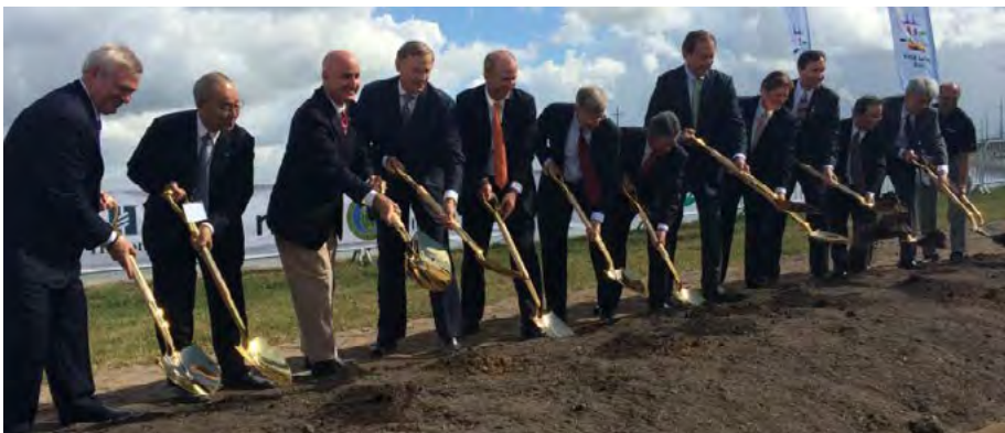
Petra Nova Groundbreaking from September 2014

The post-combustion carbon capture Petra Nova project began commercial operation at the W.A. Parish Plant in Thompsons, Texas, USA, officials announced. The U.S. Department of Energy (DOE) provided funding and the National Energy Technology Laboratory (NETL) provided project management support for the project, which demonstrates how carbon capture technologies can support the flexibility and sustainability of fossil fuels at a commercial scale. The Petra Nova project has the potential to capture 1.6 million tons of carbon dioxide (CO 2 ) per year from an existing coal-fired power plant. From energy.gov on January 11, 2017.