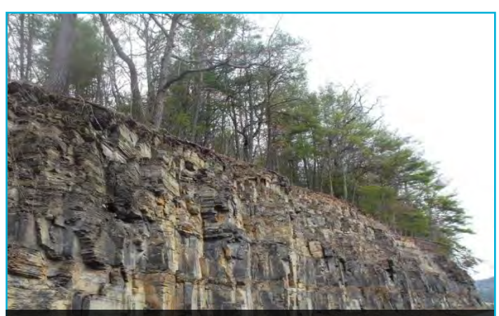
Parallel, vertical, orthogonal natural fracture faces (joint sets) in an outcrop of organic-rich Millboro Shale (Marcellus equivalent), Clover Creek, VA. Photo by Dan Soeder, 2014.

Newsletters, program fact sheets, best practices manuals, roadmaps, educational resources, presentations, and more information related to the Carbon Storage Program is available on DOE's Energy Data eXchange (EDX) website .