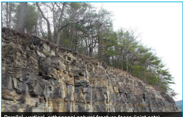
Parallel, vertical, orthogonal natural fracture faces (joint sets) in an outcrop of organic-rich Millboro Shale (Marcellus equivalent), Clover Creek, VA.

Newsletters, program fact sheets, best practices manuals, roadmaps, educational resources, presentations, and more information related to the Carbon Storage Program is available on DOE's Energy Data eXchange (EDX) website .